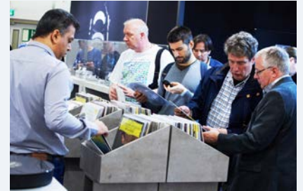
High demand for vinyl

Since 2005, the annually chosen "Best Art Vinyl Award" represents the most creative record cover. In 2015, this prize was awarded for the 10th time. The cover artworks can be seen all days of the fair in the lobby of the MOC between Halls 1 and 2 on the ground floor.