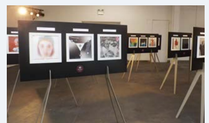
Presentation of the best record covers