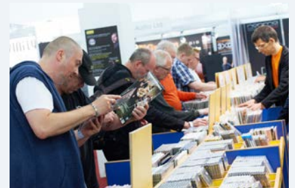
Music lovers on the HIGH END