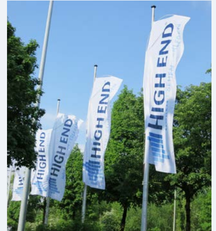
HIGH END signs in front of the entrance > picture download

Reproduction permitted; we would be grateful to receive a copy.